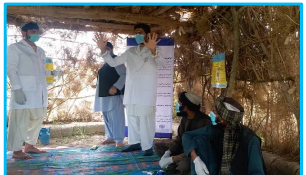
Health workers in Afghanistan deliver training in health care messaging and COVID-19 protection measures.

Through Gavi support and the existing immunisation infrastructure, Afghanistan put in place proactive measures to maintain routine immunisation (RI). This includes: (i) engaging religious and community leaders, as well as members of the community, to increase awareness around vaccination; (ii) training volunteers in vaccine-preventable disease (VPD) surveillance; and (iii) mobilising the national health team to develop and carry out the emergency response plan.