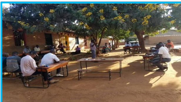
Community leaders Engagement and Sensitization Meetings in township of Lilongwe, Malawi.

(i) renovation of infrastructure, such as point of entry isolation centres, biosafety laboratory and infectious disease treatment centres; (ii) disease surveillance and operational costs for isolation and treatment centres; (iii) health worker capacity building (a total of 420 health workers have been trained in contact tracing, while 320 laboratory technicians have been trained in handling COVID-19 samples and lab testing); and (iv) community engagement sessions with local leaders and a total of 490 community leaders in 20 suburbs of Lilongwe.