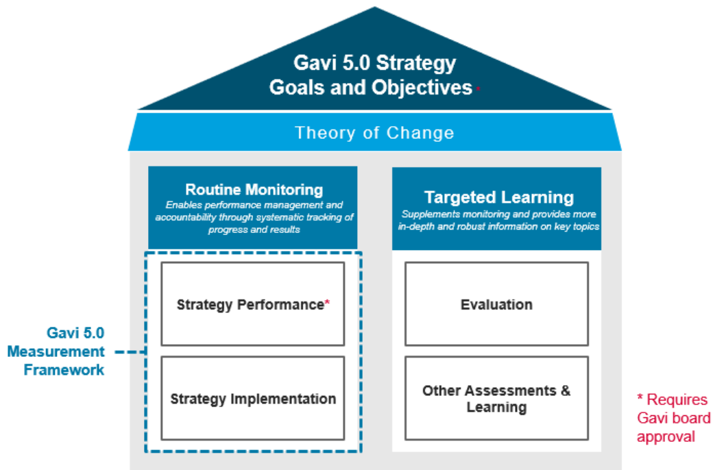
Figure 1. Proposed Gavi 5.0 M&E system