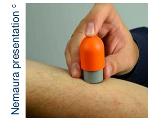
Nemauro presentation c

Separate, spring-powered applicator (Implavax®)