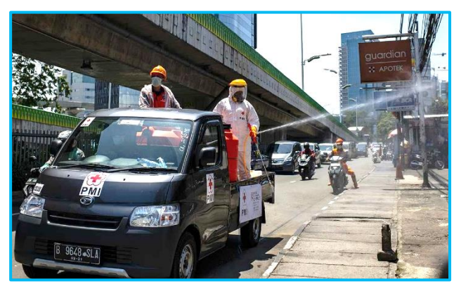
Photo: Spraying streets with disinfectants, Indonesia

Countries continue to strengthen their efforts in responding to the growing pandemic. In Cox's Bazar, Bangladesh, information from UNICEF indicates that with the support of local government bodies, COVID-19 response efforts are being strengthened, including on hard-to-reach islands, through: radio; TV; leaflets and other materials; and trainings on infection prevention and control (IPC).