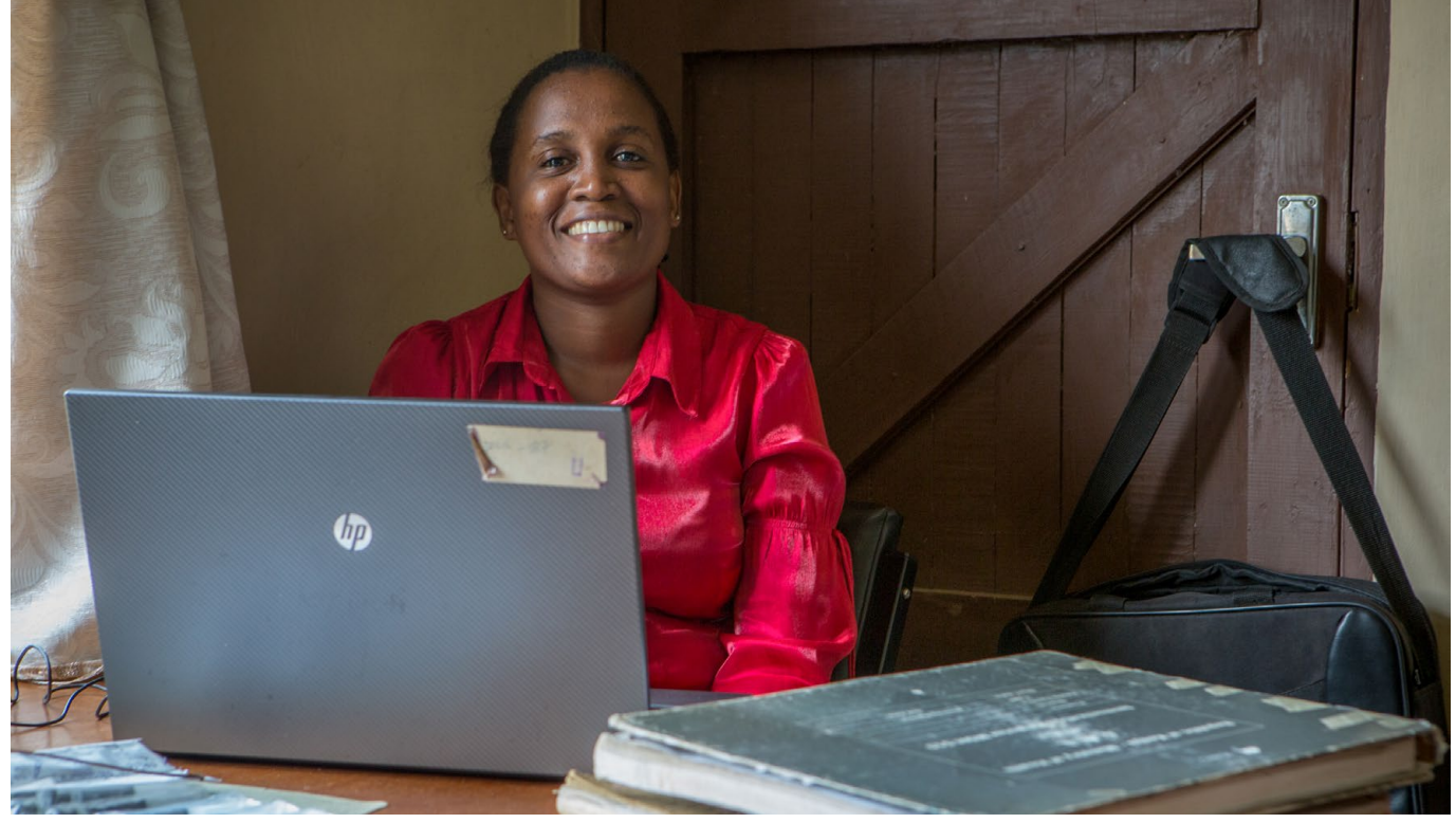
1 National Country Roadmaps for Immunisation DHI were facilitated in Cambodia, Central African Republic (CAR), Ethiopia, and Nigeria as part of the Gavi DHI Strategy development process between May and August 2022.

This guide supports targeted efforts to operationalise Gavi, the Vaccine Alliance's Digital Health Information Strategy which includes "gender-intentional" in the vision and prioritisation of gender-related activities that can support scale and impact by overcoming negative gender biases, gender dynamics, and the effects of the gender digital divide on digital health interventions. During the development of National Country Roadmaps for Digital Health Information (DHI) for Immunisation as part of the Gavi DHI Strategy testing process<sup>1</sup>, it was clear that while gender was included as a priority in the National Immunisation Strategy, it was unclear which aspects of gender or how it would be addressed. In addition, it was difficult to engage in meaningful conversations related to gender among immunisation and digital health stakeholders during sub-national and national-level workshops. As time and resources are limited it was advised that any gender-related resource would need to be quick and easy to use with the aim of helping countries, health systems, and their digital health interventions move incrementally across a continuum of gender programming towards gender